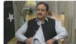
CM increases amount of Rehmatul-lil-Alameen Scholarship to Rs one billion