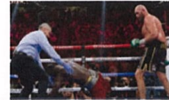
British professional boxer Fury defeats American boxer Wilder with 11th round knockout to retain WBC title