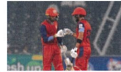
Northern confirm semi-final spot with thrilling last over win