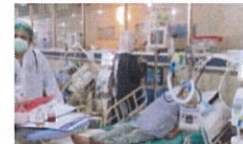
COVID-19 positivity come down to 1.88% in Pakistan